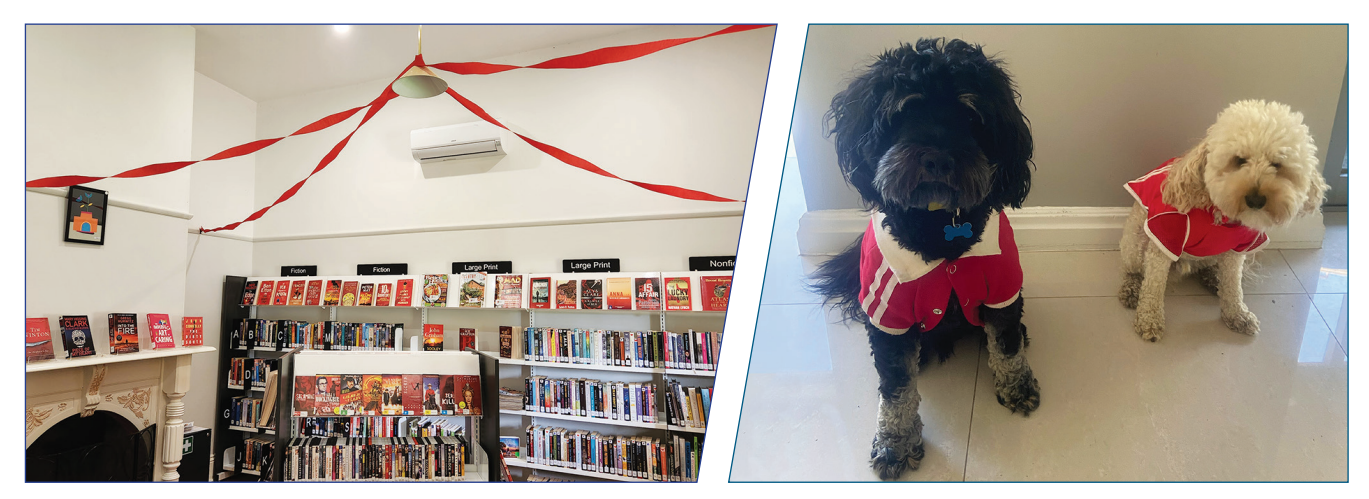
Goulburn Valley Library, VIC