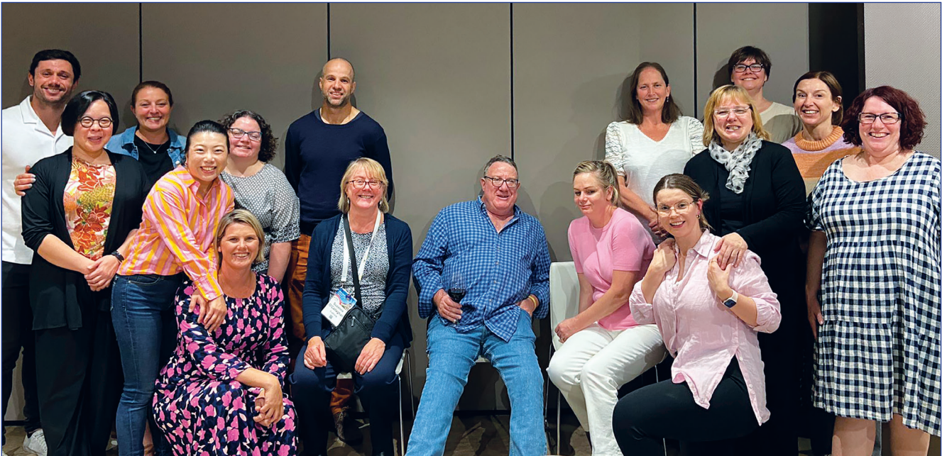
Australian Congress delegates